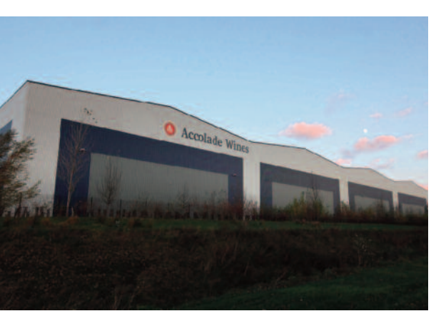
Accolade Park in Bristol

With regard to importers, the UK remained the biggest importer of bulk wines in 2015, according to Il Corriere Vinicola , followed by Germany, the US, France and Italy. Outside of mature markets, Russia, which had been pegged as an emerging player for bulk wine, suffered a downturn in 2015, in part because of the collapse of the rouble. The value of its bulk wine imports dropped by $8m, causing it to fall behind even the comparatively tiny Belgium. China is emerging as a future prospect for the bulk wine